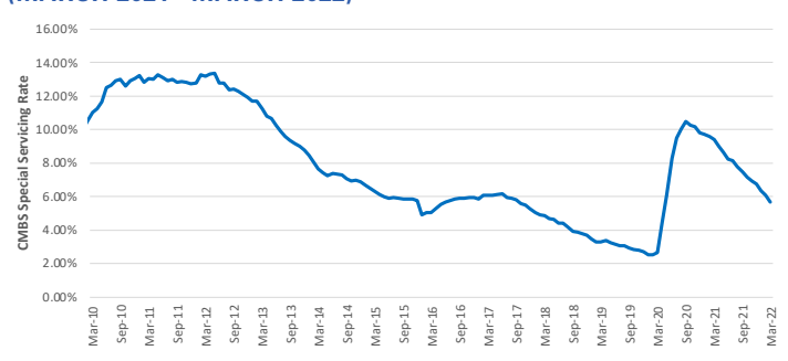
CHART 1: CMBS SPECIAL SERVICING RATE (MARCH 2021 - MARCH 2022)

Other noteworthy transfers include the $80 million Chicago Ridge Mall ( COMM 2012-CR2 ) loan and the $78.7 million Bellis Fair Mall ( GSMS 2012-GCJ7 ) loan.